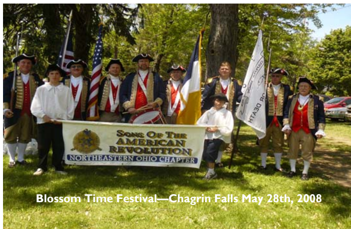
Blossom Time Festival—Chagrin Falls May 28th, 2008