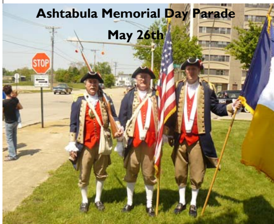
Ashtabula Memorial Day Parade May 26th